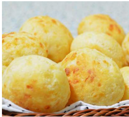
Pão de queijo