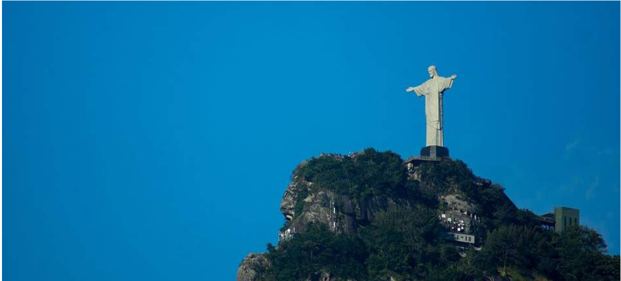
Christ the Redeemer: An Art Deco statue of Jesus Christ in Rio de Janeiro, Brazil, created by French sculptor Paul Landowski and built by the Brazilian engineer Heitor da Silva Costa, in collaboration with the French engineer Albert Caquot.

Rio de Janeiro is a large seaside city in Brazil, which is famous for its Copacabana and Ipanema beaches, Christ the Redeemer statue atop Mount Corcovado and for the Sugarloaf Mountain. In February, its Carnaval festival, features parade floats, flamboyant costumes and samba dancers, and is considered the world's largest.