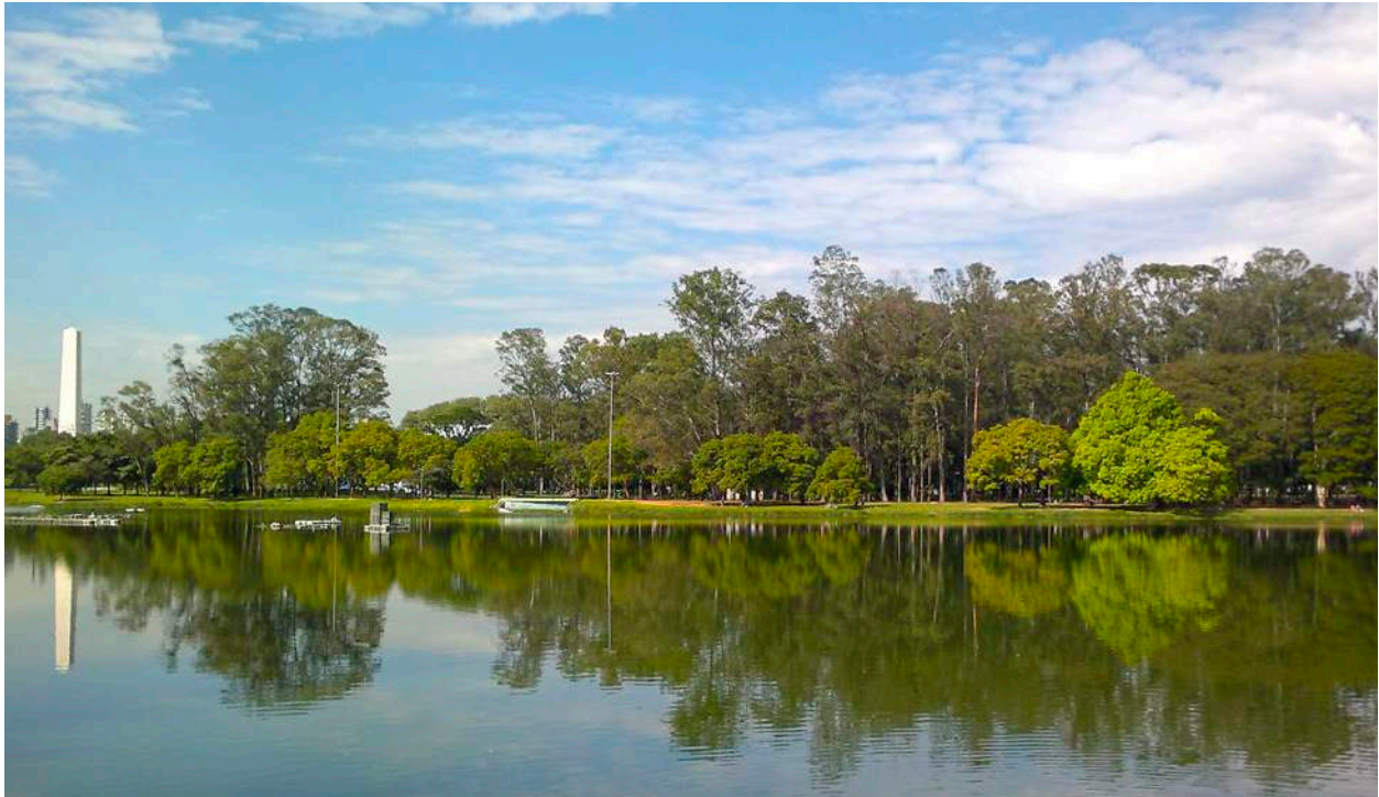
Ibirapuera Park: An urban park in São Paulo. It comprises 158 hectares.