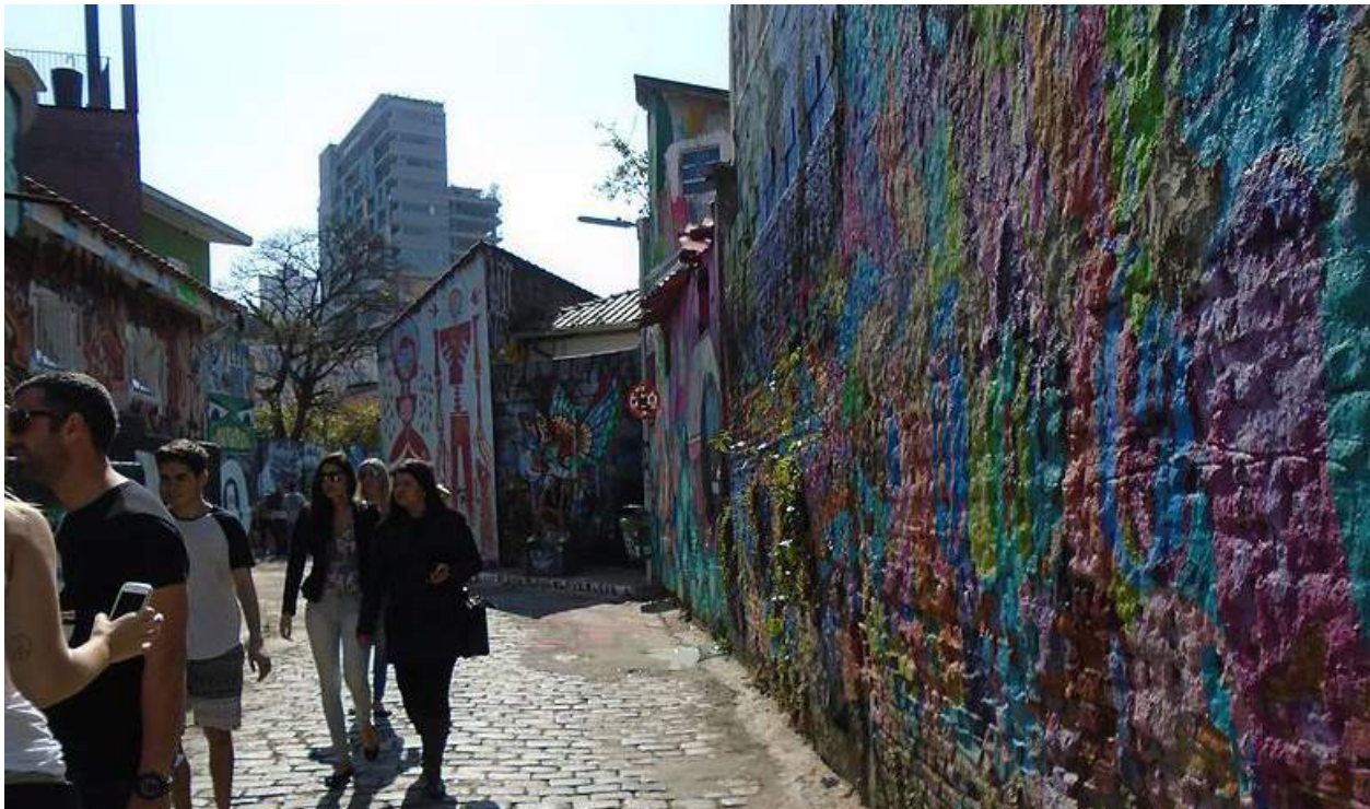
Batman Alley: The nickname for the area is attributed to a graffito of the DC Comics character Batman which was painted on one of the walls in the 1980s.